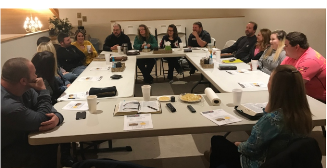
Marriage Bible Study

For this cause shall a man leave his father and mother, and shall be joined unto his wife, and they two shall be one flesh. This is a great mystery: but I speak concerning Christ and the church. Ephesians 5:31-32